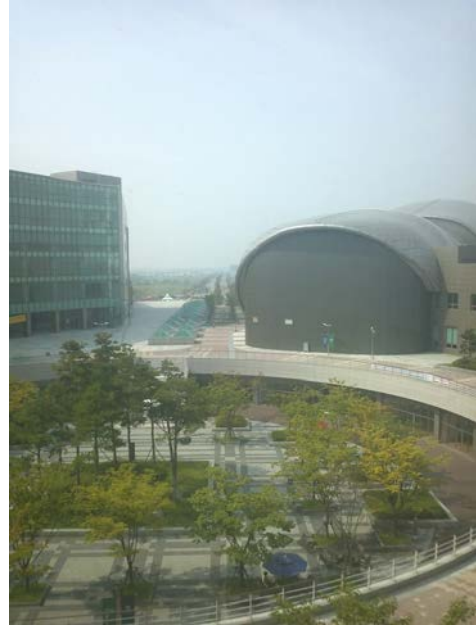
Mason Korea campus