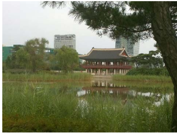
Songdo, home of Mason Korea

Mason Korea may have its growing pains, being an infant in the world of higher education, but it is my hope the students who unknowingly have become our trailblazers will come to realize and appreciate the unique opportunities they have been given. That statement is directed at our local students just as much as it is meant for our Mason Korea students. While it is true Mason may currently only be offering a few courses, which mainly come from the Mason Core, and three degree programs (BS Economics, BA Global Affairs, and BS Management); I believe there are opportunities to be found by all our undergraduate students, regardless of program of study. There is a rich cultural and educational experience just waiting to be introduced to all our students.