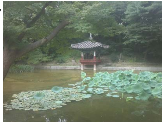
Secret Garden at Changdeokkung Palace, Seoul

Personally, while I may be considered a seasoned traveler by many who know me, this was my first time to cross over the Pacific for my travels. South Korea could not have been a better ambassador. The people; whether it be complete strangers, our students, their parents, or the people who work at Mason Korea, continuously made feel welcomed and supported at every turn. My only hope is that I find the opportunity to visit again.